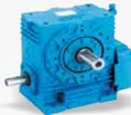
SNU WORM GEAR BOX