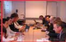
Communication with foreign enterprises in 2012