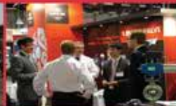
International communication with the Swedish in 2007