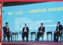
"2016 CPPI Industry High-level Summit"