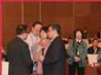
2012 CPPI Pulp & Paper Technology Forum