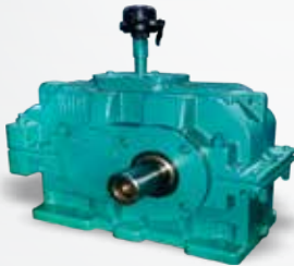
EON PARALLEL SHAFT GEARBOX

As Asia's largest and most trusted manufacturers of Industrial gears, we, at Elecon, have been delivering path-breaking innovations and world-class products designed to make the pulp & paper industry more efficient, productive and profitable. Come, join hands with us and you will know our cutting-edge technology and manufacturing excellence can become a huge plus for your business too.