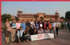
"CPPEP" in 2015