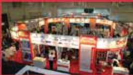
"CPPEP" in 2009